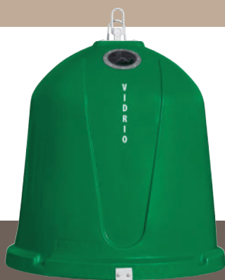
Green container is only for glass containers