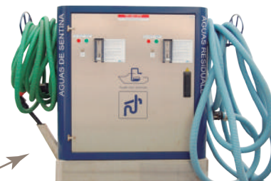
SEWAGE AND BILGE