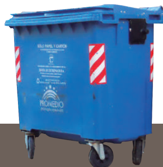
Blue container is only for paper and cardboard