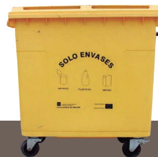
Yellow container is only for plastic containers cans, tetrapak, foil and plastic bags.

For more information visit www.portsdebalears.com