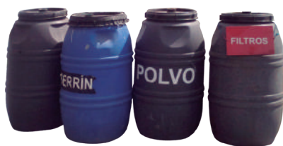
OTHER DANGEROUS RESIDUES